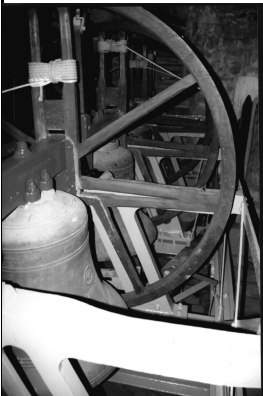
The bells of St. Mary's